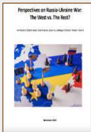
Global perspectives on the Russia-Ukraine war: The West vs. the Rest?