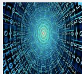
Digital Technologies & Governance