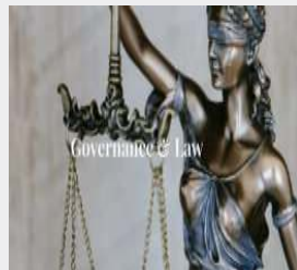
Governance & Law