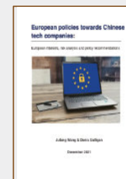
European policies towards Chinese tech companies