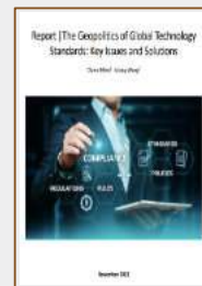
The Geopolitics of global technology standards: Key issues and solutions